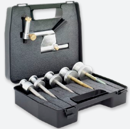
Calder Surprep Tool Kit