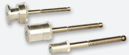
Calder Surprep Mandril Inserts

Caldertech Europe Bretfield Court, Dewsbury, West Yorkshire WF12 9BG, UK T: +44 (0)1924 469571 E: info@caldertech.com