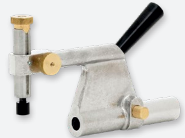
Calder Surprep Rotary Scraping Tool