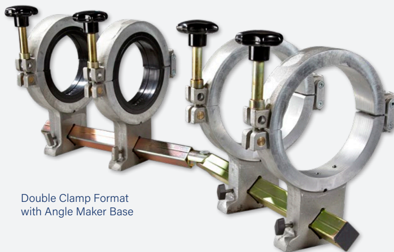
Double Clamp Format with Angle Maker Base

Caldertech Europe Bretfield Court, Dewsbury, West Yorkshire WF12 9BG, UK T: +44 (0)1924 469571 E: info@caldertech.com