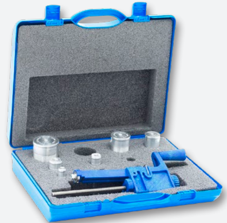
Calderprep™ Plus Tool Kit