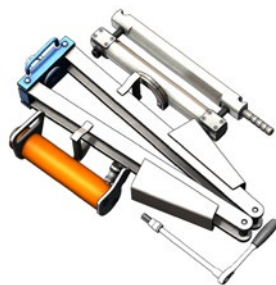
SQT250A-2 Basic squeeze tool kit without pump or stops

Note: other stop sizes available on request.