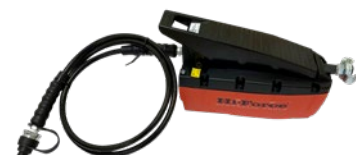
13927 Air driven pump assembly