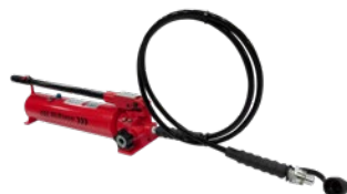
13926 Hand pump assembly