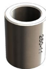
35885/DIA-SDR End stop (2 required per beam set)