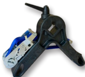
34989 / 12799