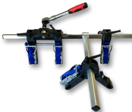
Titan 200 being used with T-Adapter and V-Block