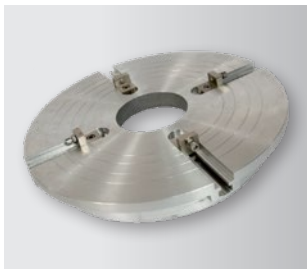
Stub Flange Adaptor