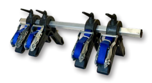
Extra V-Blocks can added for further rigidity