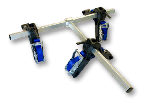
Example of T-Adapter and V-Block being used