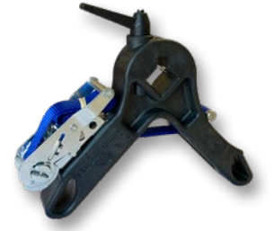
34989 / 12799